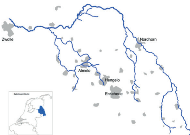
Fig.2 The Vecht catchment

The MEDUWA VECHT(E) project consortium consists of 28 partners from 2 EU countries (NL, DE), working on the entire medicine chain in order to avoid the transfer from environmental pharmaceuticals and multi-resistant bacteria to humans and animals.