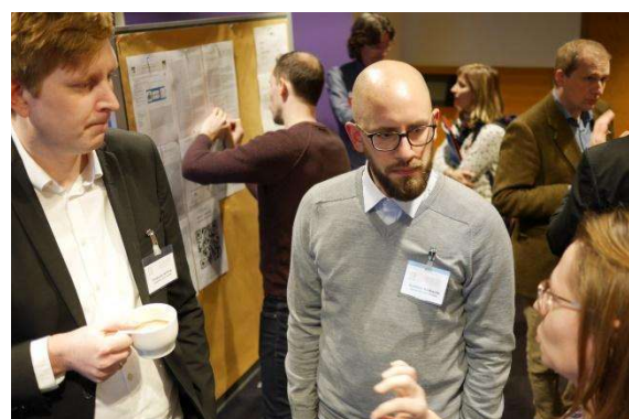
Intensive exchange between innovators and stakeholders